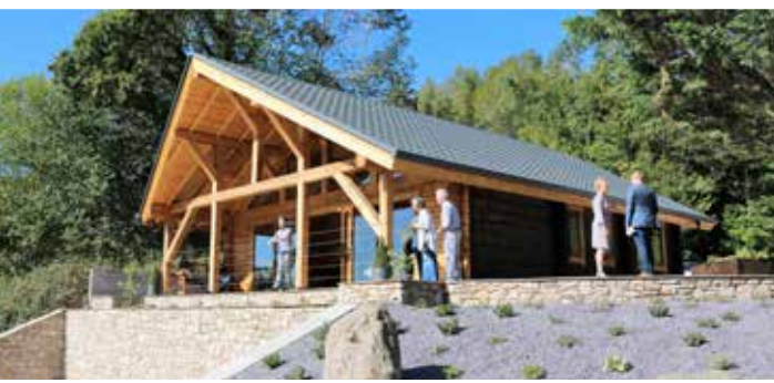
CASE STUDY MAES MYNAN PARK