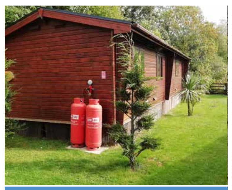
CASE STUDY HERONS LAKE RETREAT